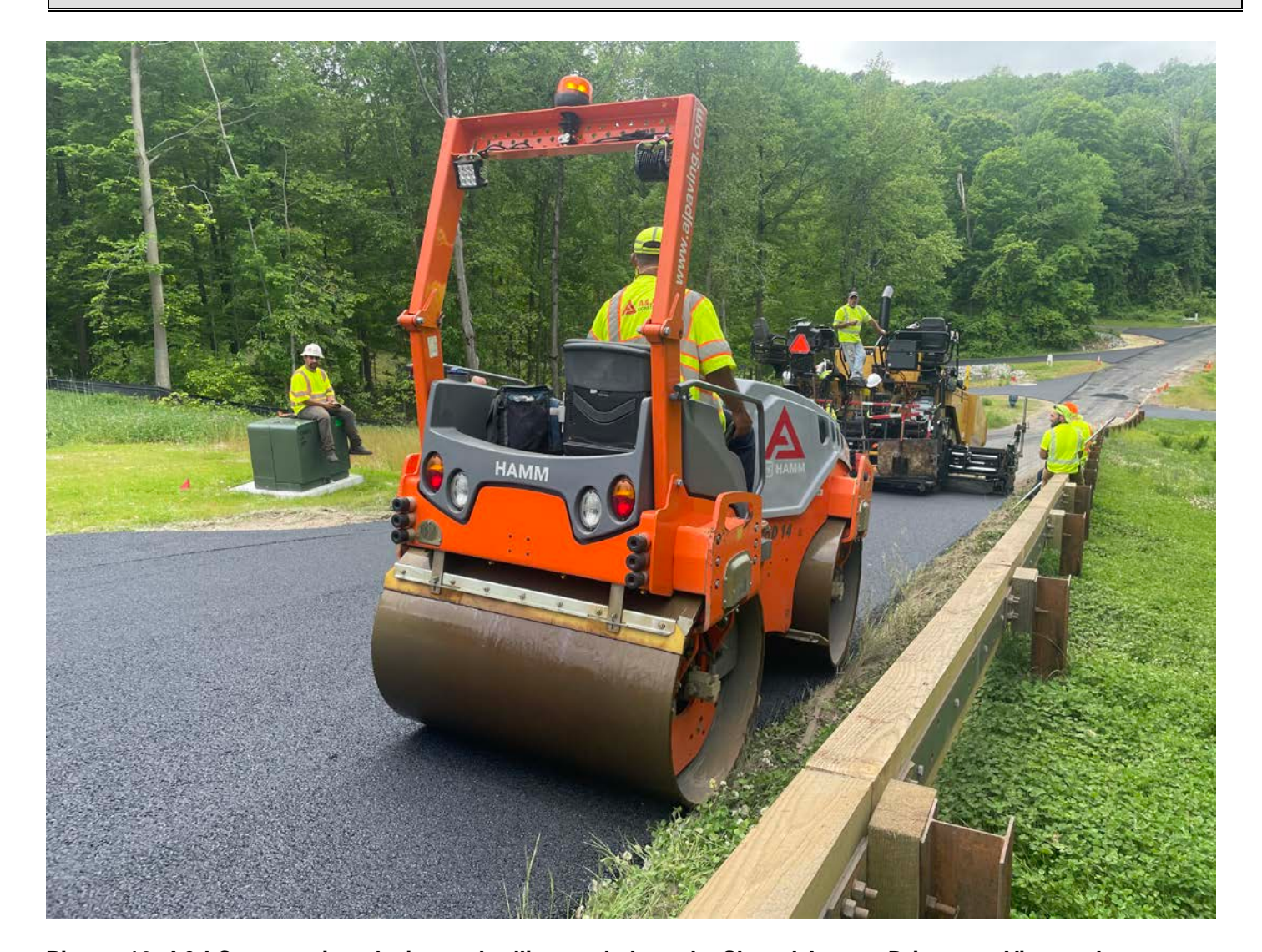
Picture 16: A&J Construction placing and rolling asphalt on the Shared Access Driveway. View to the west.