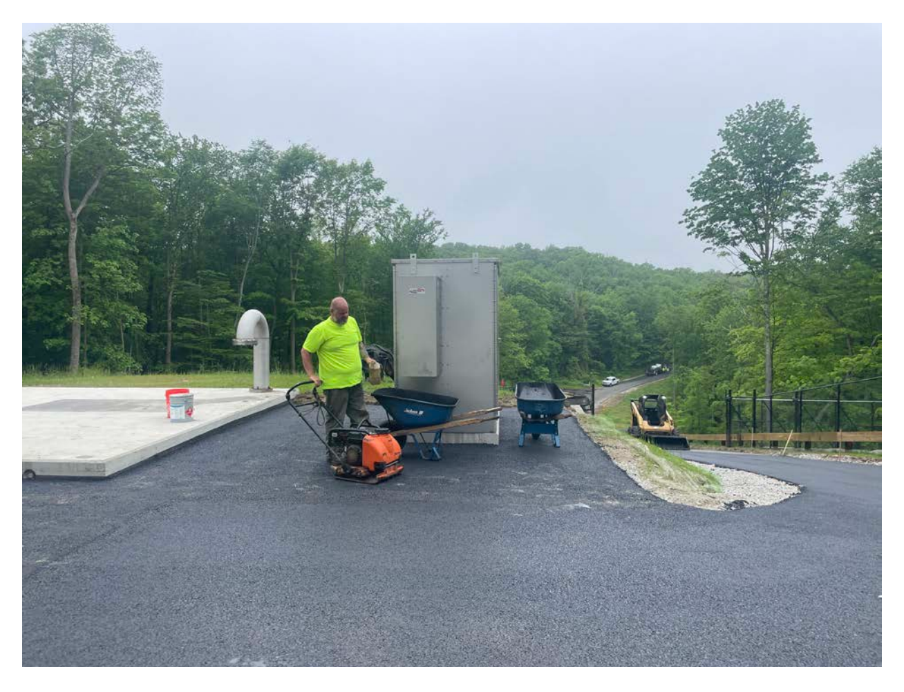
Picture 8: The electrical enclosure located on the south side of the water tank where A&J Construction just placed the first of two lifts of asphalt. View to the west.