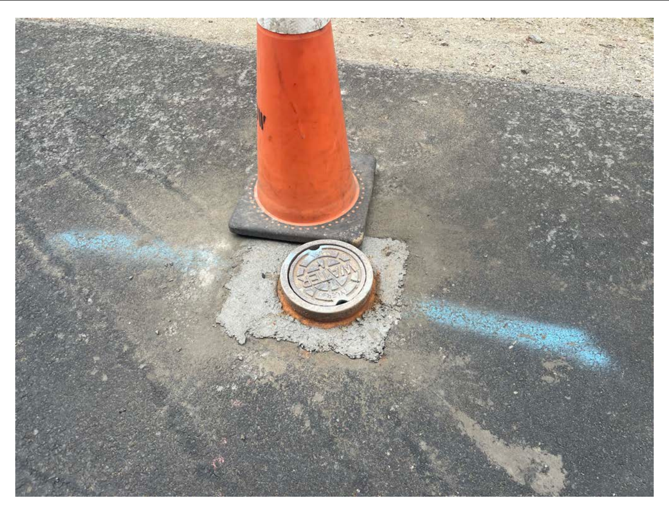
Picture 10: Station 17+91 where Ludlow placed concrete around a road box they raised. View to the northwest.

Contractor: Ludlow Construction Page: 14 of 20