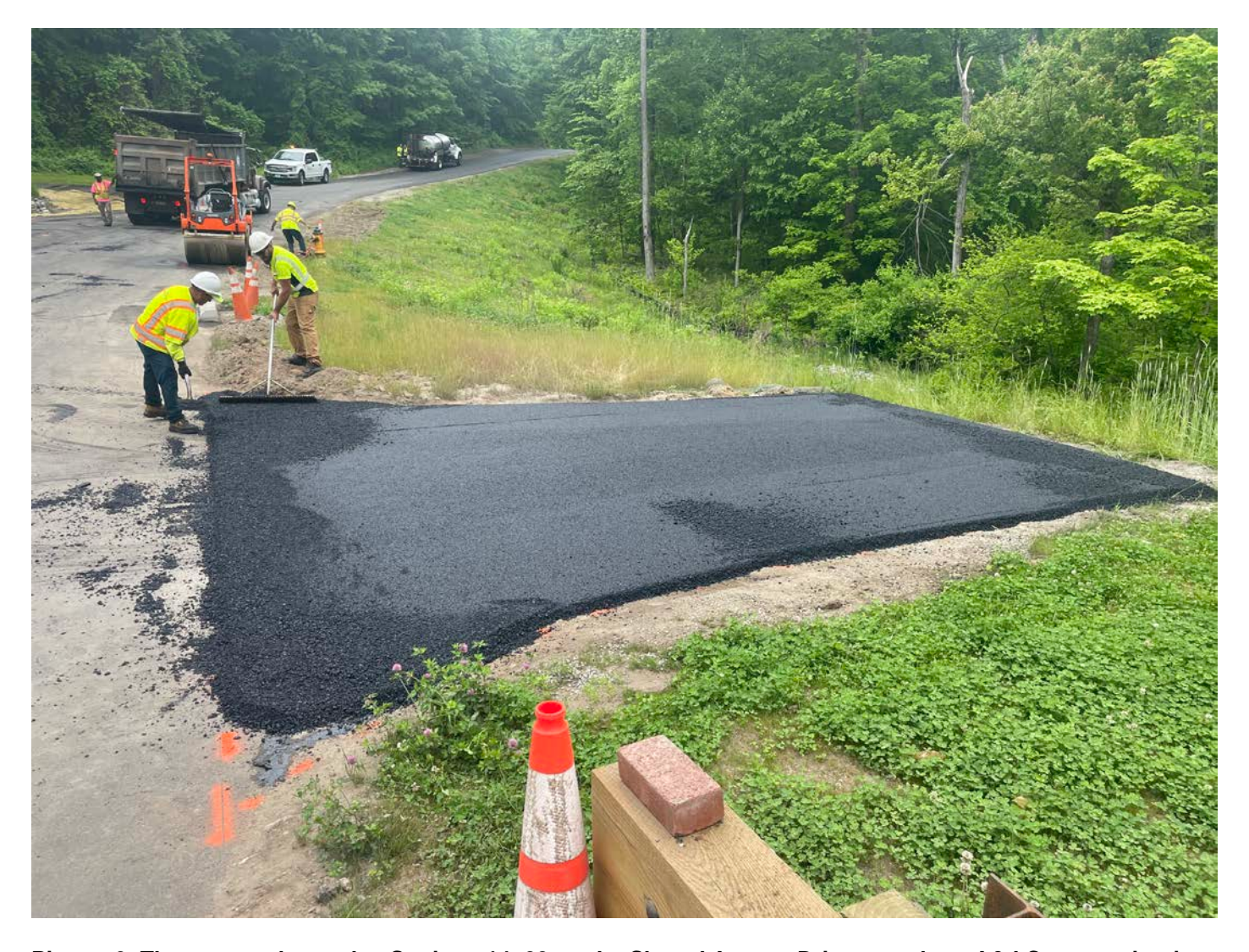
Picture 6: The turn out located at Station ~14+00 on the Shared Access Driveway where A&J Construction just placed a lift of asphalt. View to the west.

Contractor: Ludlow Construction Page: 10 of 20