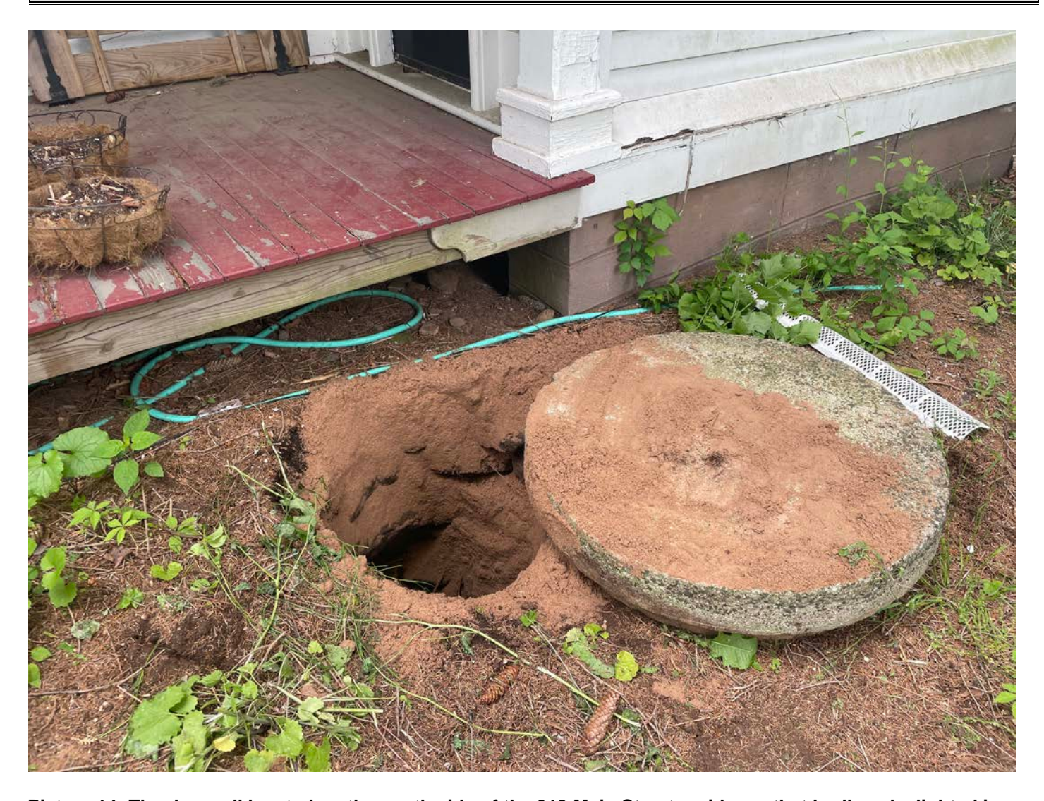
Picture 14: The dug well located on the south side of the 313 Main Street residence that Ludlow daylighted in order to allow Grela to decommission the well. View to the north.

Contractor: Ludlow Construction Page: 18 of 20