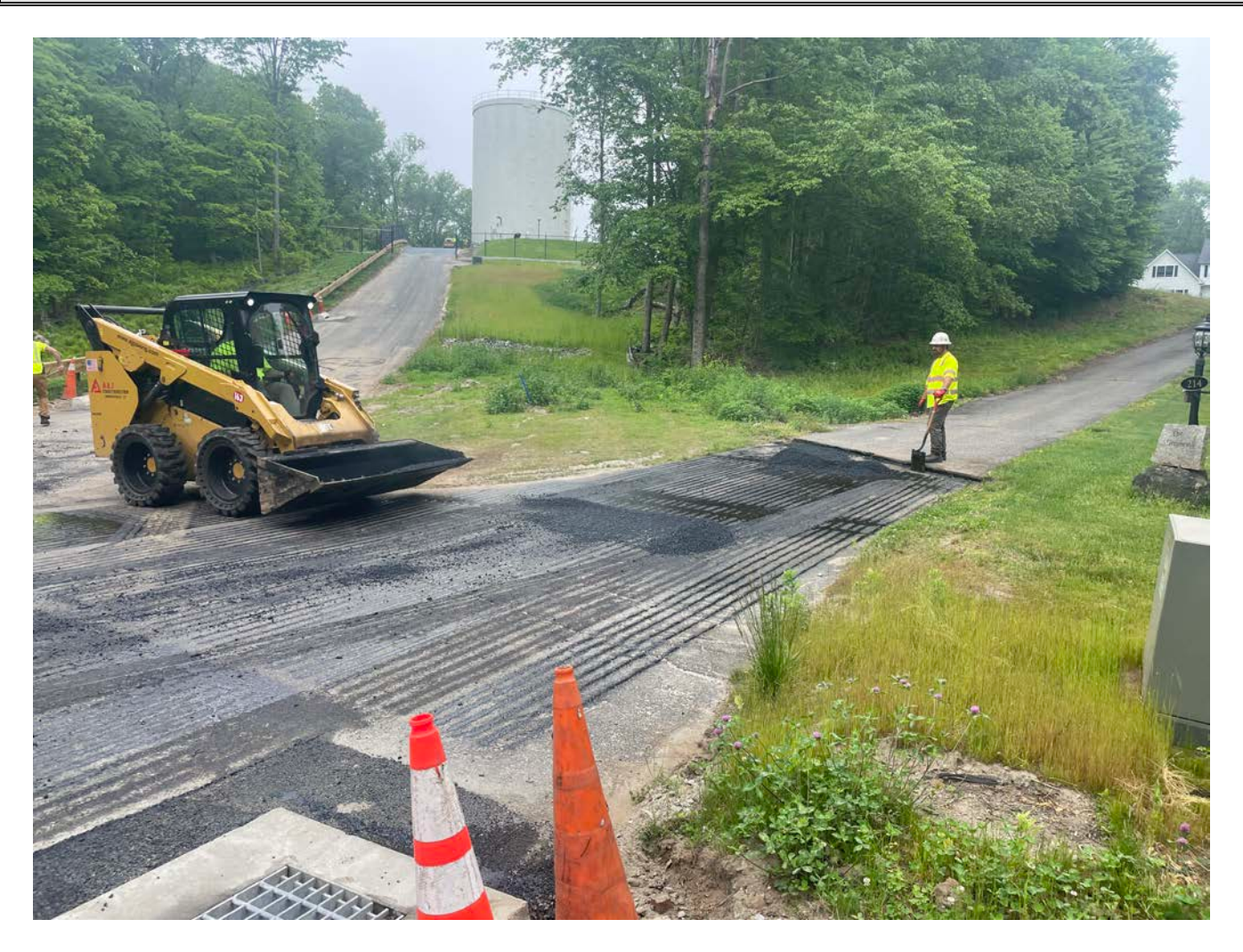
Picture 5: A&J Construction about to place asphalt on the driveway apron for the 224 Talcott Ridge Drive property after having placed tack coat. View to the east.

Contractor: Ludlow Construction Page: 9 of 20