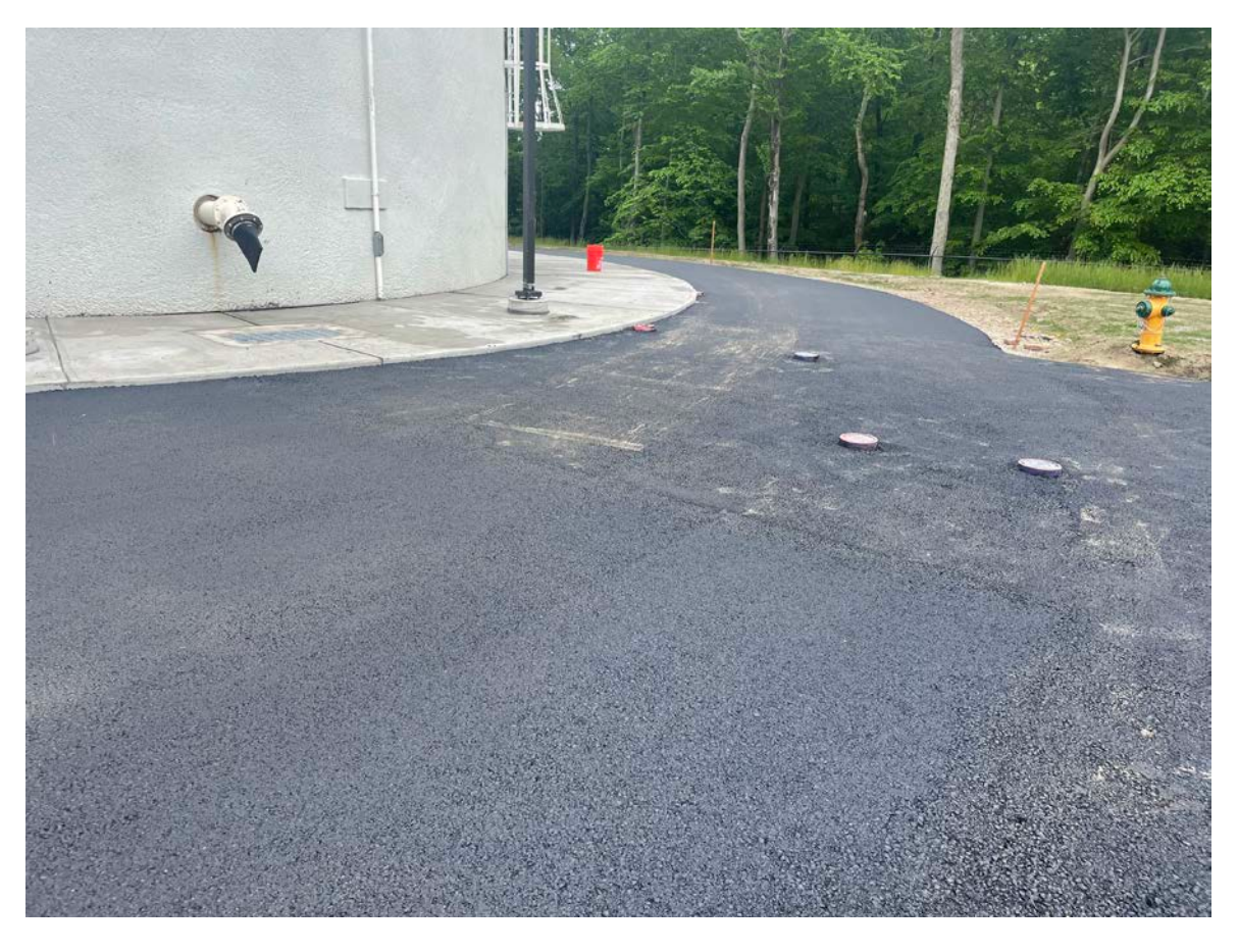
Picture 7: The south side of the water tank where A&J Construction just placed the first of two lifts of asphalt. View to the south.

Contractor: Ludlow Construction Page: 11 of 20