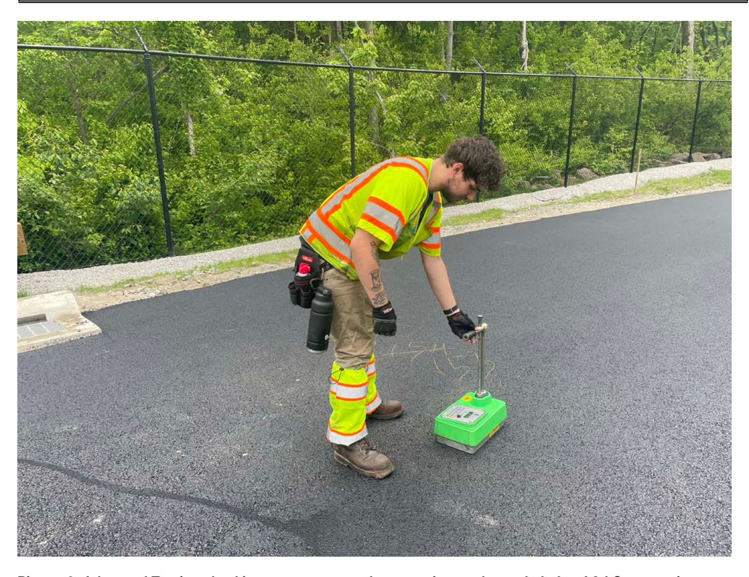
Picture 9: Advanced Testing checking temperature and compaction on the asphalt that A&J Construction placed at Station ~10+50 on the Shared Access Driveway. View to the northeast.

Contractor: Ludlow Construction Page: 13 of 20