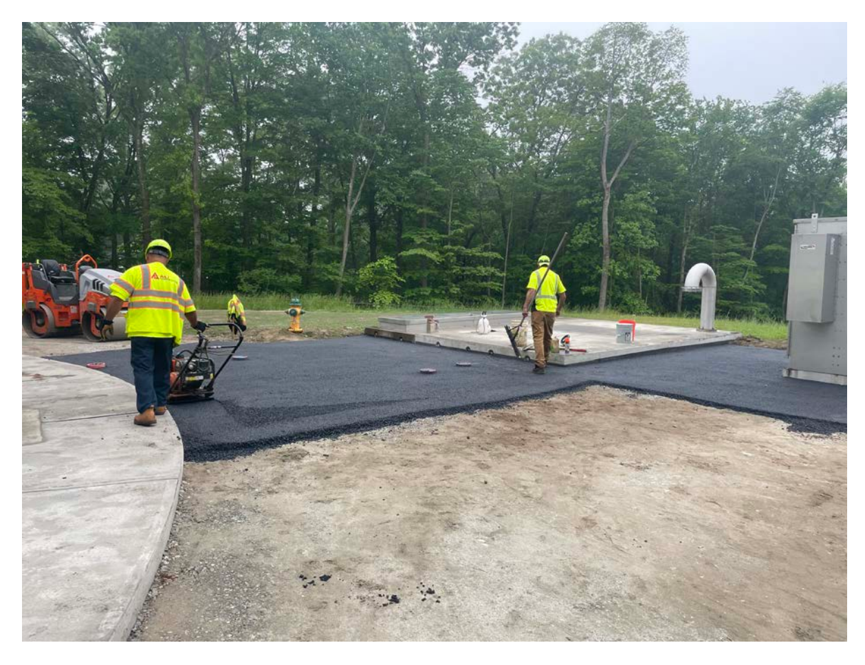
Picture 1: A&J Construction placing the first lift of asphalt around the electrical enclosure located on the west side of the water tank located on the east side of the Shared Access Driveway. View to the southwest.